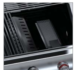
Infrared Searing Burner