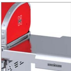
Extendable, Stainless Steel Side Shelves