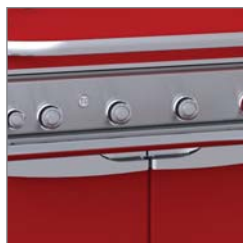
Stainless Steel Concealed Control Panel & Front Shelf