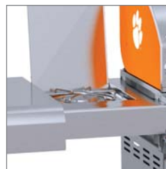
Concealed Side Burner